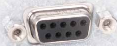
RS232 standard on all General Protocol, Advanced Protocol and Advanced Protocol Security models/sizes

Heratherm incubators offer exceptional data monitoring systems that provide the key to reliable results.