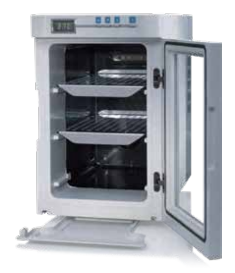
Heratherm Compact Microbiological Incubator, 18 L

The most compact unit of the Heratherm Microbiological Incubator family has an 18 L capacity, ideal for a personalized workspace