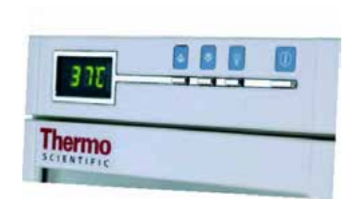
Easy to use interface

Effective testing methods for diagnosis and treatment require culturing the bacteria at 41.5° to 42°C. The use of anaerobe jars or gas packs is recommended, since low oxygen conditions improve the growth.