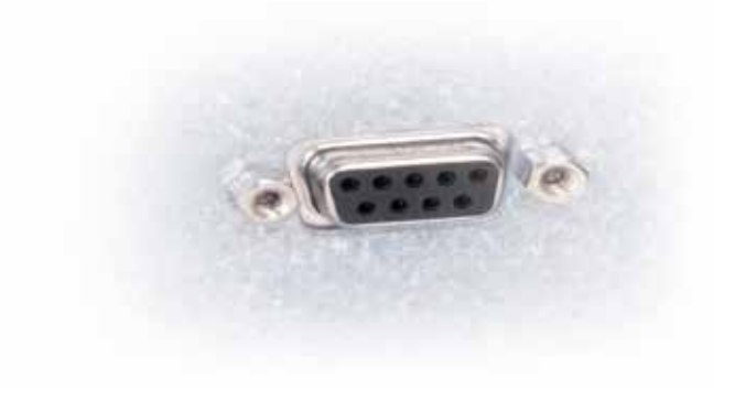
RS232 standard on all General Protocol, Advanced Protocol and Advanced Protocol Security models/sizes