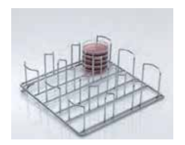
Petri dish holder