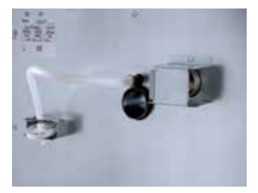
Stacking kit Supp