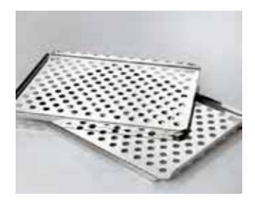
Stainless steel perforated shelves