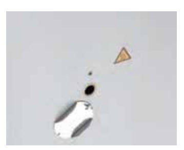
Additional access port right