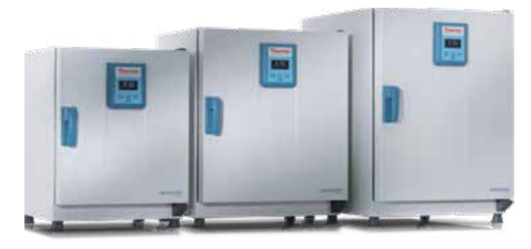
Heratherm General Protocol Microbiological Incubators, 60 L, 100 L, 180 L models