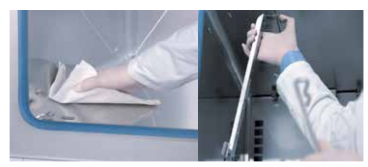
clean rounded corners