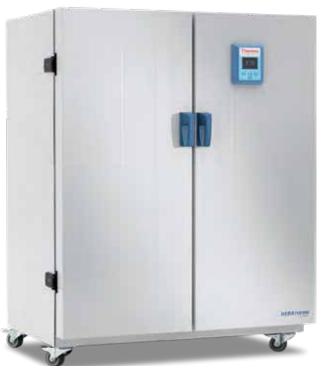
400 L and 750 L unit available