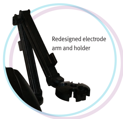
Redesigned electrode arm and holder