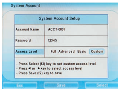
Create name, password and access level for up to ten users

Use password protection to secure selected meter functions while leaving others accessible for the customized security needed for your laboratory and data reporting needs. The system access feature can easily be turned on or off as the needs of your lab change for the ultimate flexibility in operation and ease-of-use.