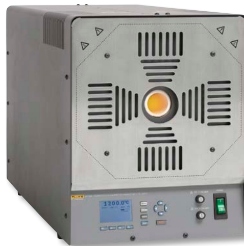
9118A Thermocouple Calibration Furnace

The following uncertainty analysis lists each uncertainty in both standard and expanded form. The difference between standard and expanded is that the standard uncertainty has been multiplied by some coverage factor, typically stated in the form of a value of k , to become an expanded uncertainty. Or, an uncertainty is divided by a conversion divisor to estimate its standard uncertainty ( k=1 ) value. The k value corresponds to a confidence