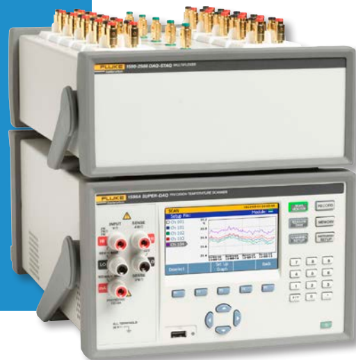
1586A Super-DAQ Precision Temperature Scanner with DAQ-STAQ Multiplexer