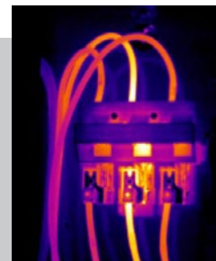
Three-phase Full Infrared