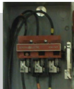
Three-phase Full Visible

Precisely blended visual and infrared images with crucial details to assist in identifying potential problems.