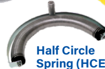
Half Circle Spring (HCE)