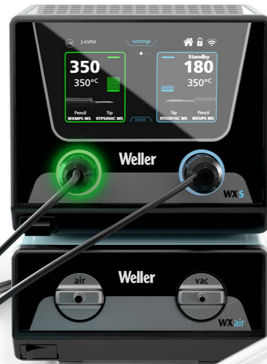
Fast connection via WiFi or cable