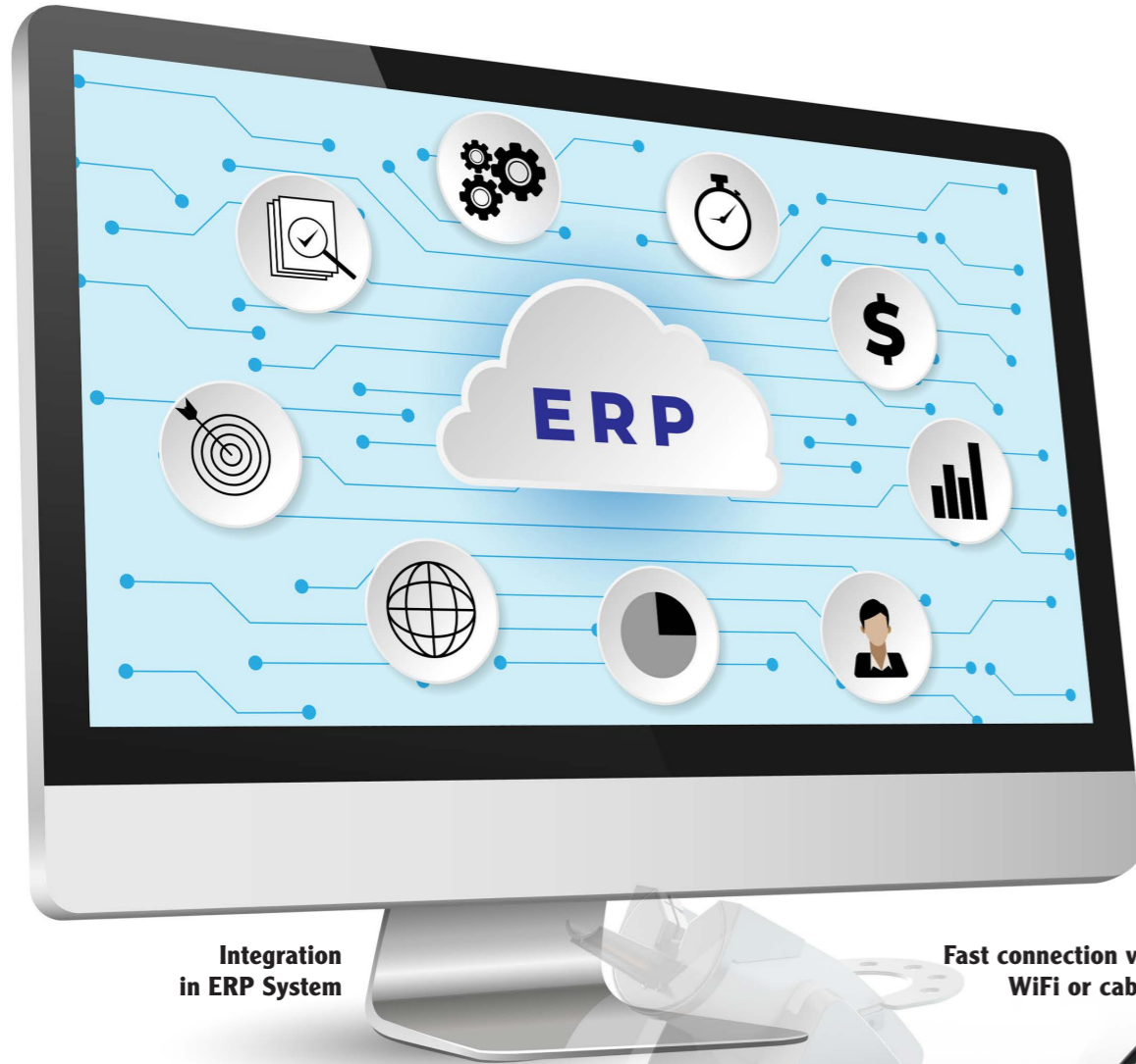
Integration in ERP System

Maximum connectivity, supporting IoT standards for full traceability with mobile-enabled, easy remote-control access.