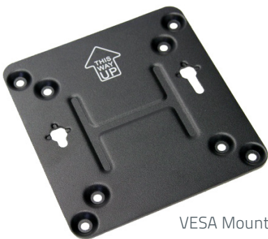
VESA Mount included