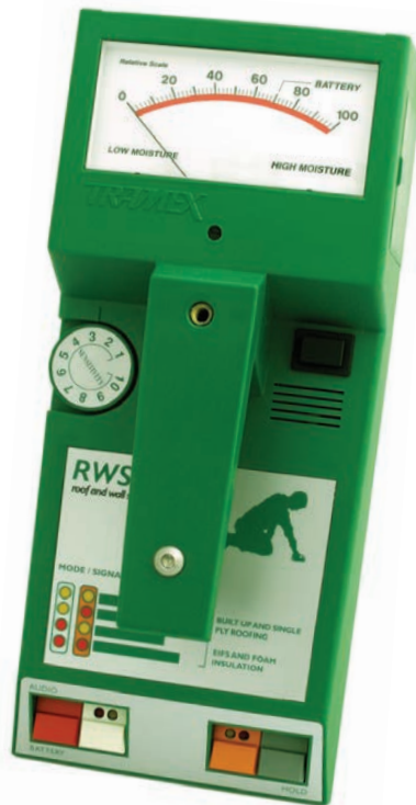
Product order code: RWS