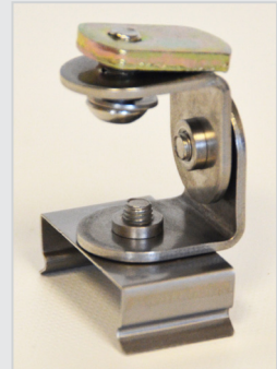
Swivel overhead rail assembly