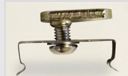
Basic overhead rail assembly