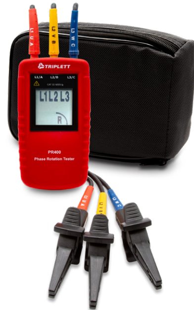
Motor and Phase Rotation Tester