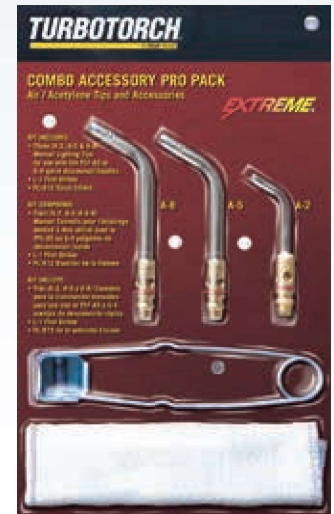
Combo Accessory Pro Pack Part No. 0386-0577