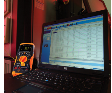
Figure 1. Automate recording of measurements with bundled GUI data-logging software.