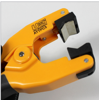
Rugged contacts with a large surface area