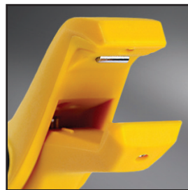
Wireless Pipe Clamp

Narrow head for tight spaces with a thermally isolated sensor for greater accuracy.