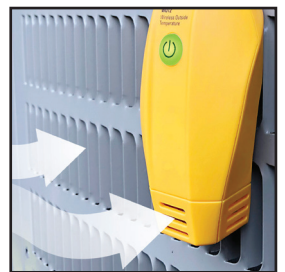
Outdoor Temperature Probe

Magnetic hanger allows for temperature measurements in direct air stream.