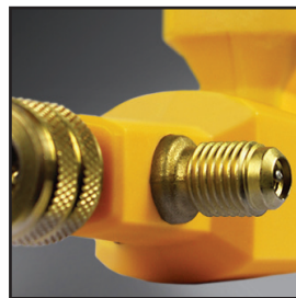
Wireless Pressure Probe

Pass thru port hook up, no hoses or adapters needed. 180° articulation allows access in tight spaces.