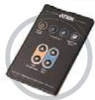
IR Remote Control Included