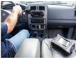
Convenient USB charging system for on the go inspectors