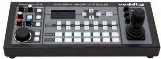
ProductionVIEW Precision Camera Controller

In our continuing drive to redefine camera control, Vaddio™ introduces the Precision Camera Controller system. Designed to control up to seven PTZ cameras, the Precision Camera Controller can be used as a stand-alone device or in conjunction with a variety of video switchers or mixers on the market today.