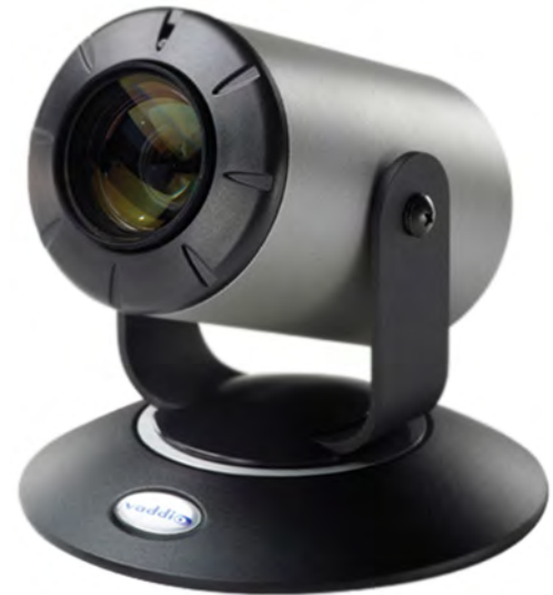
Image: ZoomSHOT 20 HD POV Camera

The advanced ISP (image signal processor) is pretty cool too, providing for fast, razor-sharp auto-focus routines with vivid colors, realistic textures and incredible detail. This ISP combined with the Exmor image sensor achieves an impressive low-light performance of 0.3 Lux (color) and 0.03 Lux (B/W).