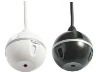
EasyMic Ceiling MicPODs (above) and EasyMic MicPOD (below)