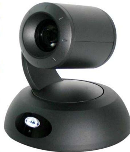
Image: RoboSHOT 30 HD PTZ Camera (Black and white models available)

The RoboSHOT 30 was designed for the times and represents a new era in specifying and integrating professional quality cameras into large room system integrations. In short, it has never been easier to integrate cameras into any large to medium room system than with the RoboSHOT 30.