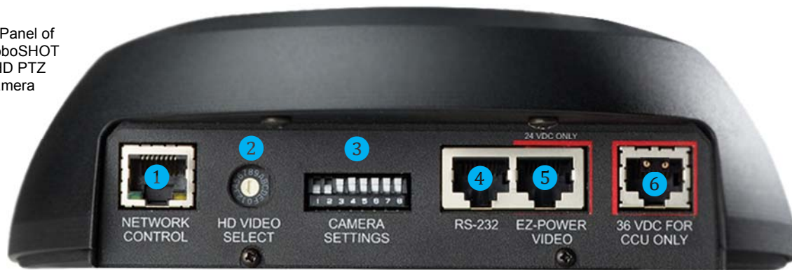
Rear Panel of the RoboSHOT 30 HD PTZ Camera