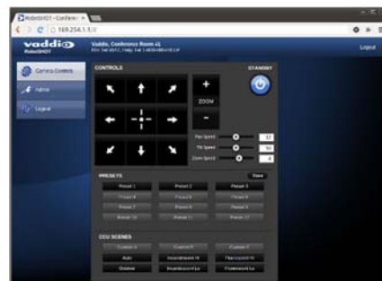
Example: Built-in Camera Control Web Page