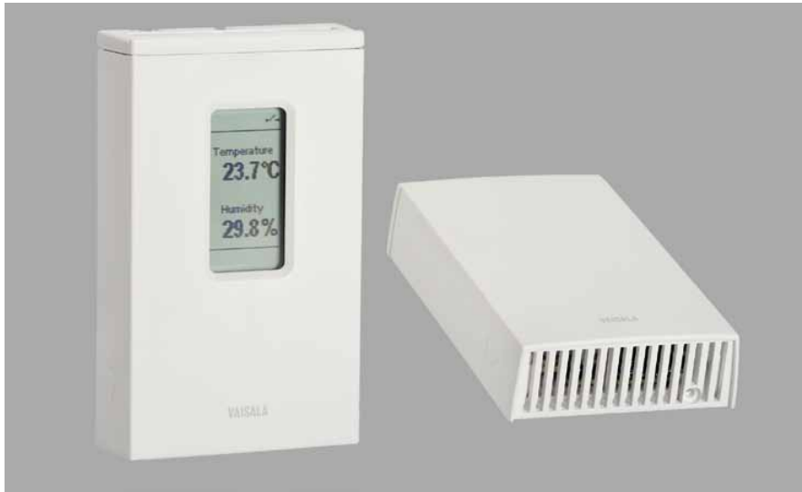
The HMW90 Series Humidity and Temperature Transmitters are designed for demanding HVAC applications.

The wall-mounted Vaisala HMW90 Series HUMICAP® Humidity and Temperature Transmitters measure relative humidity and temperature in indoor environments, where high accuracy, stability, and reliable operation are required.