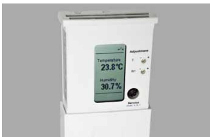
The sliding cover exposes offset trimmers and service port for calibration.

The flexible HMW90 series offers a variety of options and features. Transmitters include a display and a sliding cover with either a display opening or a solid front. Output options include special scalings and the following calculated parameters: dew point, mixing ratio, enthalpy, wet bulb temperature, dew point depression, and absolute humidity.