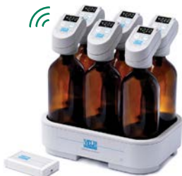
RESPIROMETRIC Sensor System - BOD 6 positions - Results on display and RESPIROSoft™