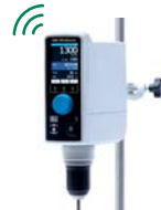
ermes enabled OHS 100 Advance Up to 100 L