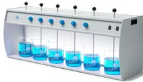
FC4S AND FC6S