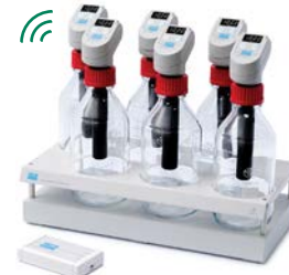
RESPIROMETRIC Sensor System MAXI - BMP 6 positions - Results on display and RESPIROSoft™