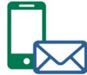
HELP-DESK AND REMOTE SUPPORT