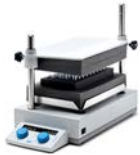
MULTI-TX5 Digital Electronic speed regulation: Up to 2500 rpm Integrated timer