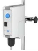
LS Up to 25 L