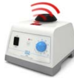
ZX4 Electronic speed regulation: Up to 3000 rpm