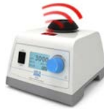
TX4 Electronic speed regulation: Up to 3000 rpm Integrated timer