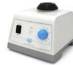
ZX3 Electronic speed regulation: Up to 3000 rpm