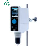
ermes enabled OHS 200 Advance Up to 100 L