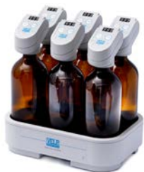
BOD Sensor System 6 - 10 positions - Results on display