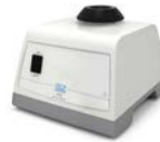
RX3 Electronic speed regulation: Constant 3000 rpm