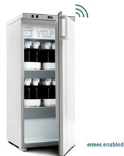
FOC 200 E Connect From 3 to 50 °C