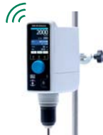
ermes enabled OHS 60 Advance Up to 40 L