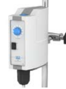
PW Up to 70 L