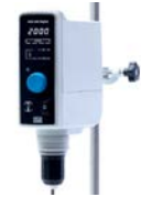
OHS 200 Digital Up to 100 L