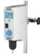
DLS Up to 25 L