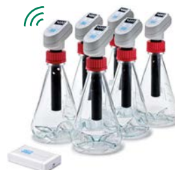
RESPIROMETRIC Sensor System for Soil Analysis Results on display and RESPIROSoft™