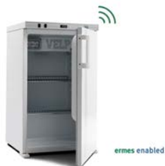
FOC 120 E Connect From 3 to 50 °C