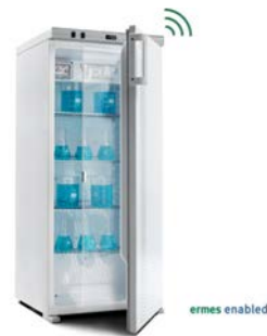
FOC 200 I Connect From 3 to 50 °C