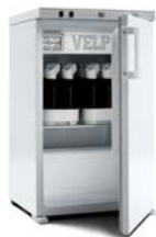
FOC 120 20°C constant