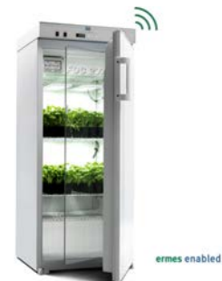
FOC 200 IL Connect From 3 to 50 °C