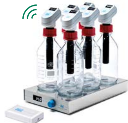
RESPIROMETRIC Sensor System for Plastic Analysis 6 positions - Results on display and RESPIROSoft™