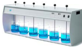
JLT 4 AND JLT 6