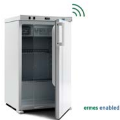
FOC 120 I Connect From 3 to 50 °C