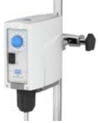
ES Up to 15 L