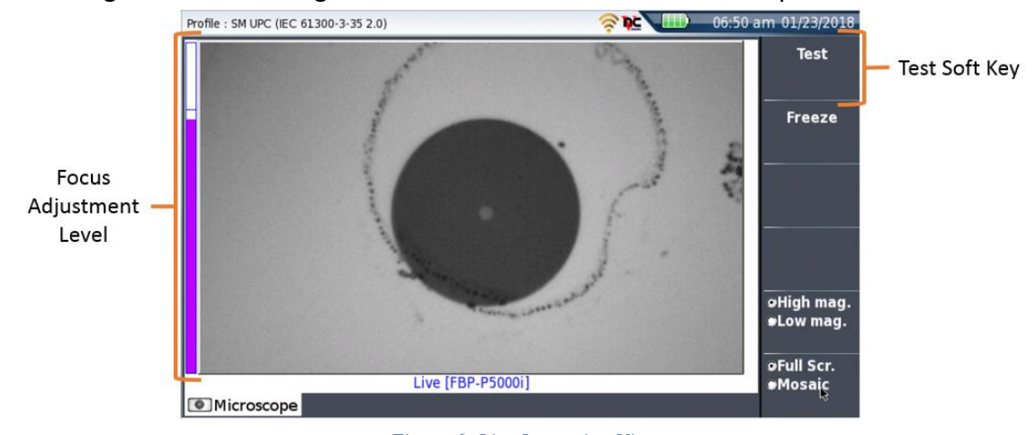
Figure 6: Live Inspection View