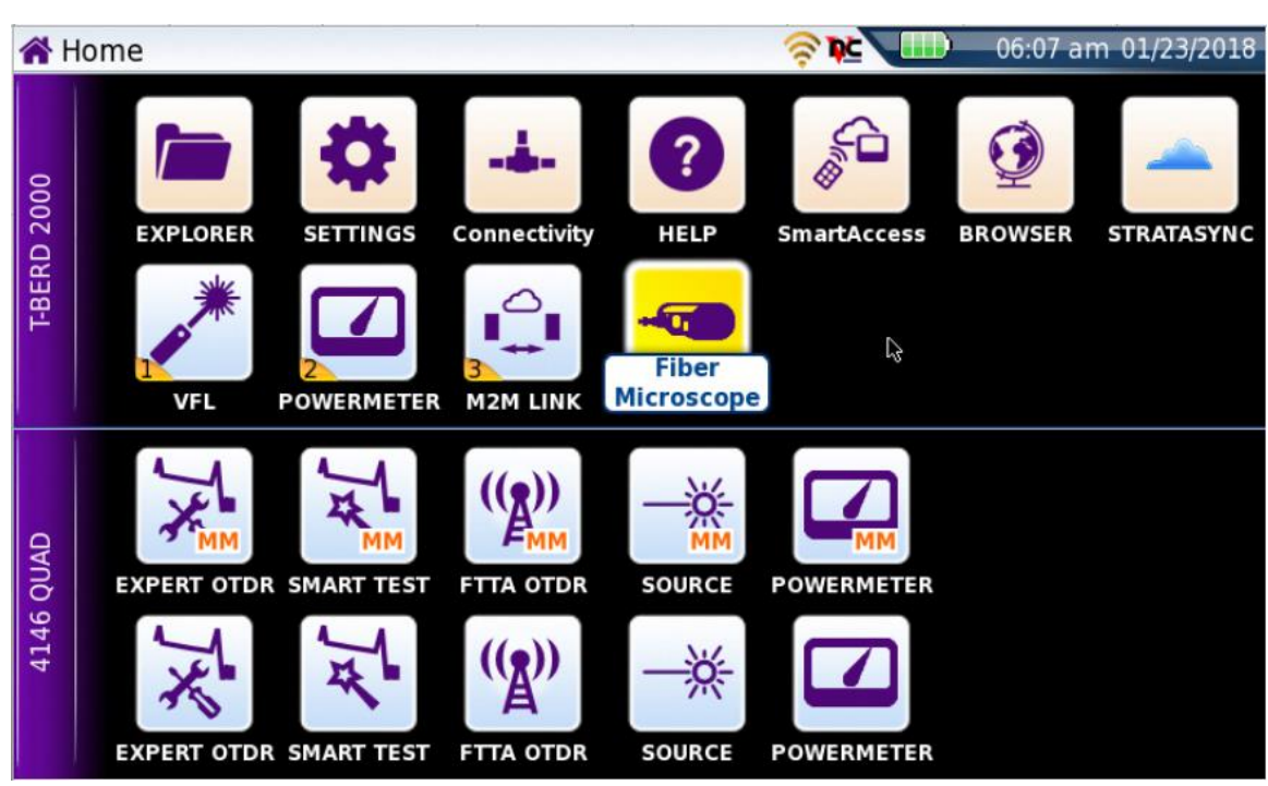
Figure 4: Home Screen

Press the Power Button to turn on the test set and display the Home screen.