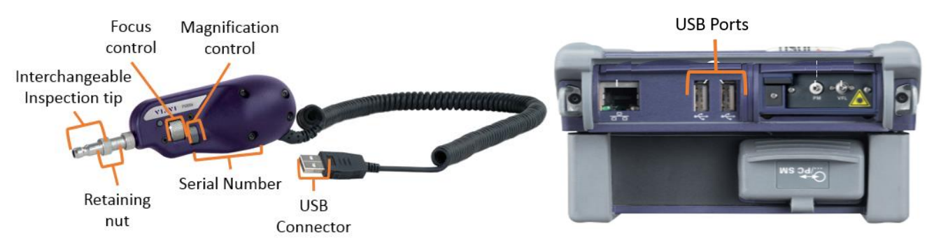
Figure 2: P5000i Microscope