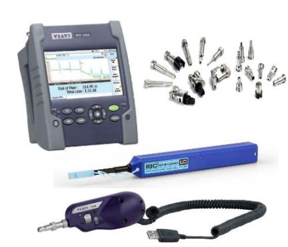
Figure 1: Commonly Used "Standard" Inspection Tips