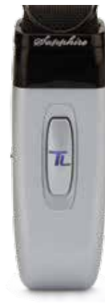
Sapphire (IRT-55) Microphone Transmitter

TeachLogic has developed infrared technology to a very high level that guarantees constant connectivity. Our microphone capsules ensure that you can achieve the maximum amount of gain before feedback, while maintaining a very natural reproduction of the presenter's voice.