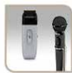
Choice of Transmitters