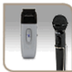
Choice of Transmitters