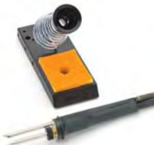
Soldering Tips: see page 87