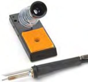
Soldering Tips: see page 87 / 97

Weller FE soldering irons are specifically designed for tip extraction applications. The smoke tube is integral with the handle and is normally placed over the joint when soldering but can be retracted when access to the joint is a problem or removed for cleaning. The irons are temperature controlled, ergonomic and allow precise handling. The electronic controlled irons can be driven from any PU /PUD series power unit compatible with the rating of the iron or any rework station. FE 50M irons can only be driven from the P51 power unit. The range of iron power ratings and the extensive range of solder tips mean that there is an iron to suit all applications. The FE irons are supplied with a 5 mm-dia. burn proof hose 2.5 m long, all handles, leads and hoses are ESD safe.