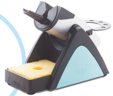
WT1010 Set pictured.

The unique, reversible WSR safety rest flips between sponge and brass wool.