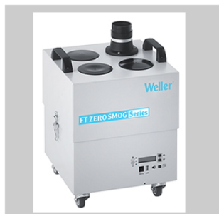
Solder fume extractors