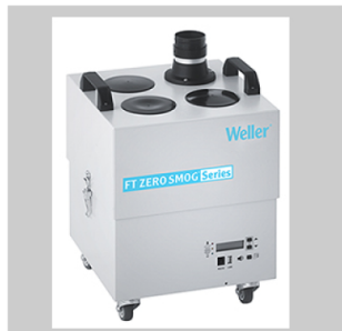
Solder fume extractors