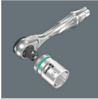
Simple direction change