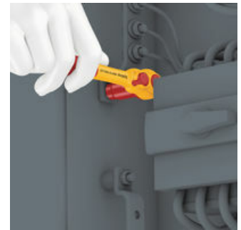
The extremely slim design of the Zyklop VDE ratchet makes it easy to work, even in confined spaces.