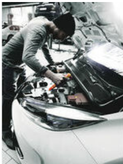
Zyklop ratchet and accessories for Electricians