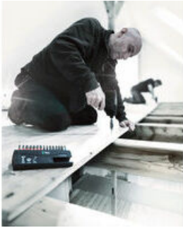
Impaktor holder with ring magnet

Impaktor technology for an above-average service life even under extreme demands