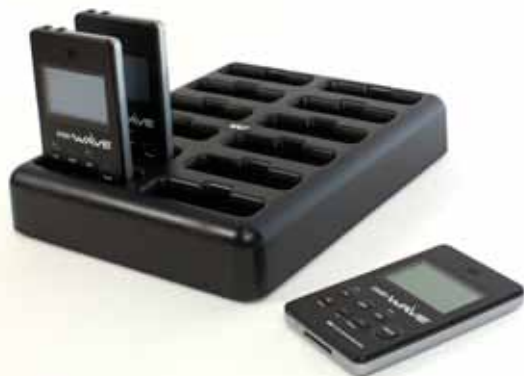
CHG 1012 with DLT 100's (sold separately)

Multi-bay, drop-in style charger. For use with the Williams Sound Digi-Wave™ DLT 100.