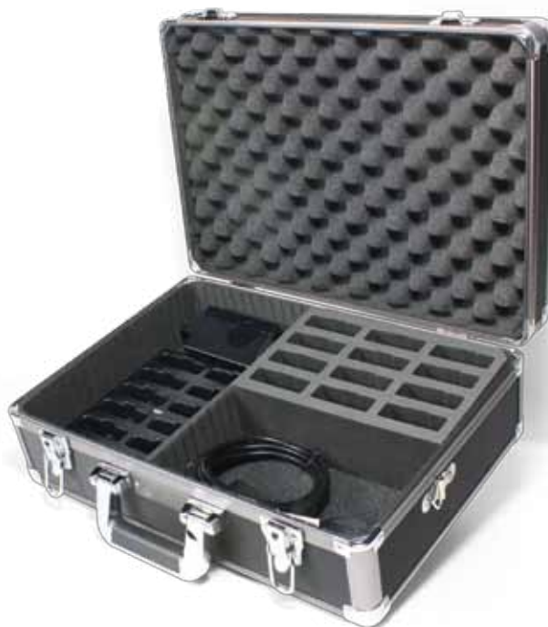
CHG 1012 PRO