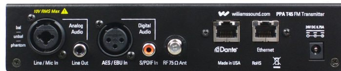
PPA T45 NET D

With an operating range of up to 1000 feet, the PPA T45 models are ideal for auditoriums, stadiums, theaters, or other large venues where superior coverage is essential. Designed to meet ADA (Americans with Disabilities Act) accessibility requirements for hearing assistance. Covered by a Lifetime PLUS Limited Warranty. Made in the USA.