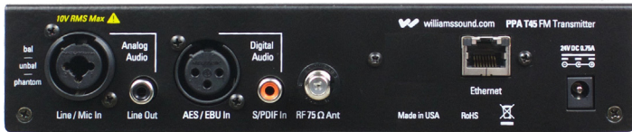
PPA T45 NET

The PPA T45 NET and NET D models fully integrate with modern networked sound systems. They feature 3 powerful microprocessors and the same high-quality audio and RF performance you've come to expect from Williams Sound. They also offer an adjustable RF output and a sleep mode for energy conservation. It's technology that takes the guesswork out of complex audio installation. Simply select between voice, music, or hearing assistance in the audio preset menu, and this transmitter quickly configures itself.