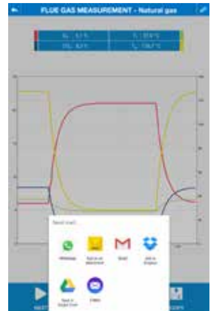
Sending the measurement data to customer