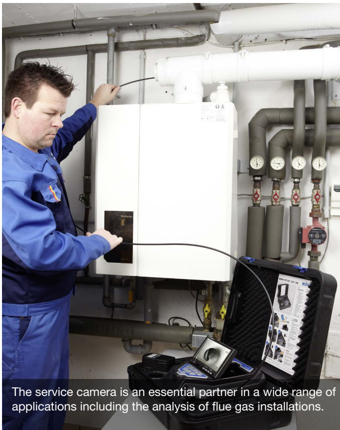
The service camera is an essential partner in a wide range of applications including the analysis of flue gas installations.