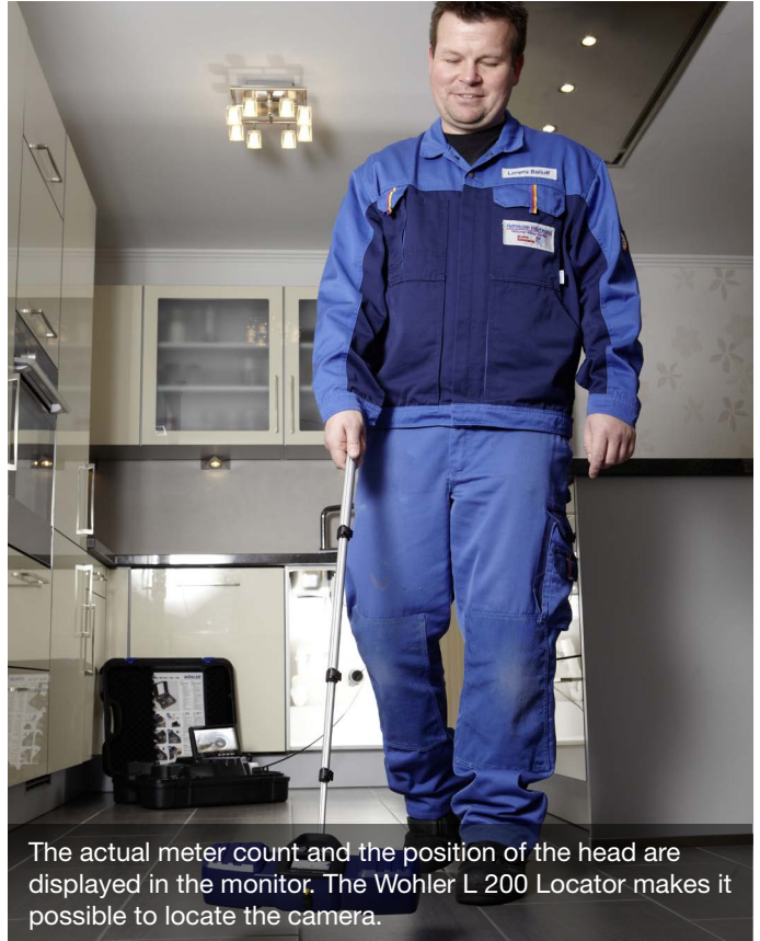
The actual meter count and the position of the head are displayed in the monitor. The Wohler L 200 Locator makes it possible to locate the camera.