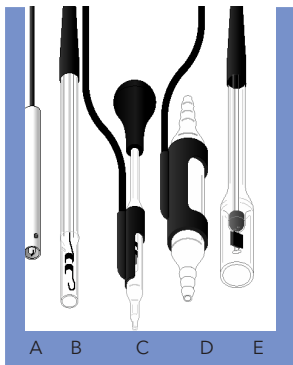
3200 series cells with built-in temperature sensors (see chart on back)

The YSI 3100 provides high-accuracy measurements for basic conductivity. Includes direct-reading digital display, adjustable temperature coefficient, and automatic temperature compensation.