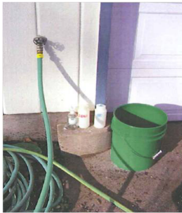
DEQ staff used a five-gallon bucket and a garden hose as a modified flow through cell for the YSI Professional Plus meter to measure nitrate in domestic wells throughout Oregon.

The Oregon Department of Environmental Quality (DEQ) Laboratory and Environmental Assessment staff collect more than 400 water samples each year from domestic and monitoring wells in three groundwater management areas in Oregon. The DEQ samples over 90 wells, including many rural home domestic wells, on a routine basis. Contamination in these areas is associated with nonpoint sources such as