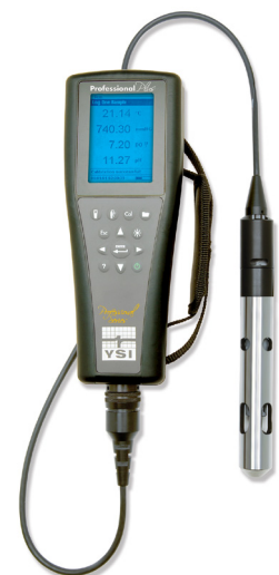
The YSI Professional Plus can measure a single parameter to multiple parameters based on application needs.