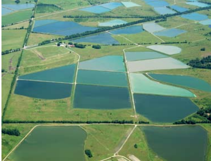
An overhead view of ponds at an aquaculture facility.

The U.S. Environmental Protection Agency (EPA) has established three kinds of criteria (one acute and two chronic) for ammonia (nitrogen), based on the duration of exposure. The acute criterion is a 1-hour average exposure concentration and is a function of pH. One chronic criterion is the 30-day average concentration and is a function of pH and temperature. The other chronic criterion is the (continued)