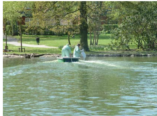
Adding lime to control ammonia levels is not an effective long-term strategy.

Lime - using lime agents such as hydrated lime or quick lime could actually make a potentially bad situation much worse by causing an abrupt and large increase in pH. Increasing pH will shift ammonia toward the form that is toxic to fish. In addition, the calcium in lime can react with soluble phosphorus, removing it from water and making it unavailable to algae.