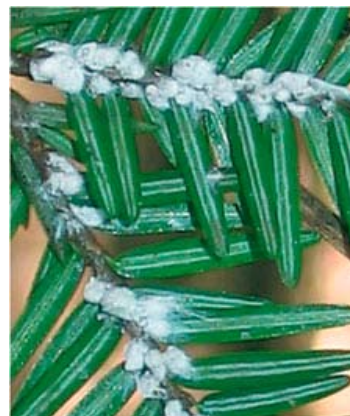
Adelgid infestations are easily recognized by the cotton like appearance on the base of hemlock needles.