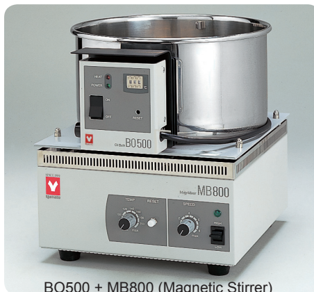
BO500 + MB800 (Magnetic Stirrer)