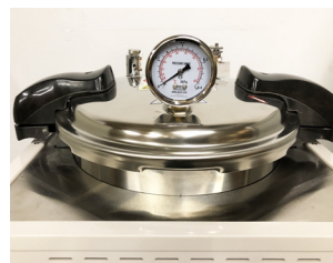
● Pressure gauge