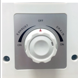
● Drain valve