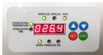
● Control panel