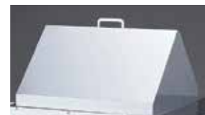
Top cover for BK/BA610,710