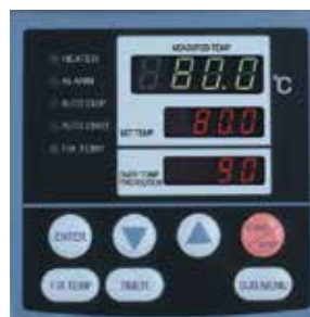
BK series control panel