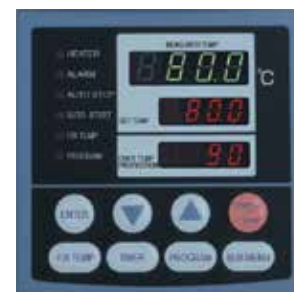
BA series control panel