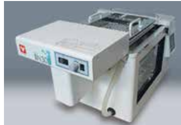
BK400 + BN300