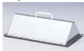
Top cover for BK/BA300,400,500