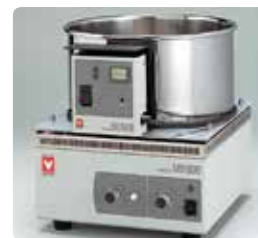
BO500 + MB800