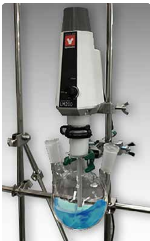
LM200 with Digital Display

LM Series compact design flask mixer features integrated drive and stirring seal allowing direct installation of flask and stirring in a vacuum and sealed state. No time-consuming shaft alignment required. Its strong stirring power is perfect for samples of high volume and high viscosity.