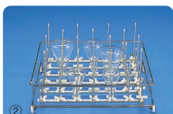
Jet rack (glasswares not included)