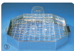
Beaker rack (glasswares not included)