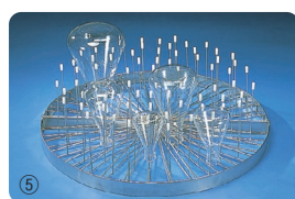
Flask rack (glasswares not included)