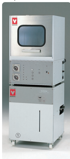
Combination with water purifier