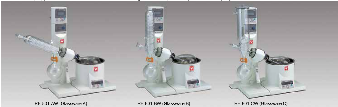
RE-801-AW (Glassware A)

Standard equipped with motorized lift, vacuum regulator, vapor temperature display and automatic distillation function