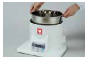
BM500 The electric kettle style tank can be removed freely