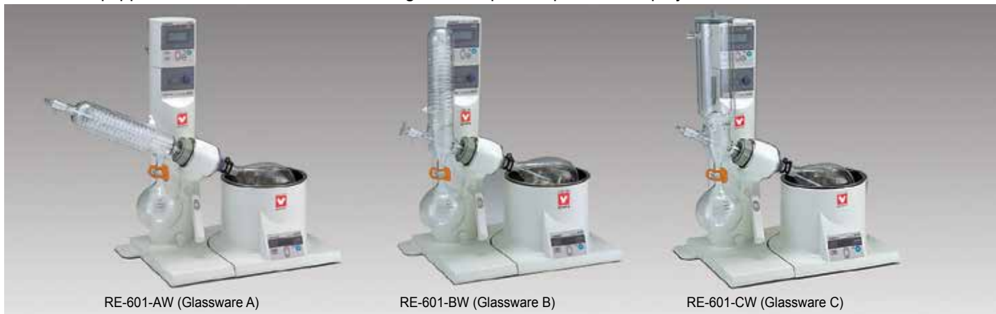
RE-601-AW (Glassware A)

Standard equipped with motorized lift, vacuum regulator, vapor temperature display functions