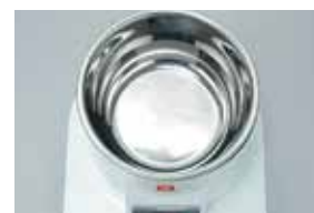
BM500 The electric kettle style tank can be removed freely