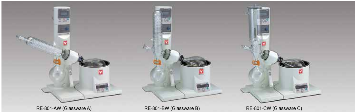
RE-801-AW (Glassware A)

Standard equipped with motorized lift, vacuum regulator, vapor temperature display and automatic distillation function