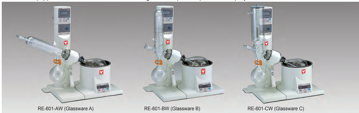
RE-601-AW (Glassware A)

Standard equipped with motorized lift, vacuum regulator, vapor temperature display functions