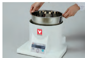
BM500 The electric kettle style tank can be removed freely