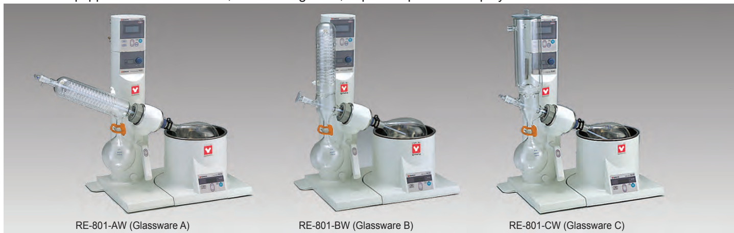
RE-801-AW (Glassware A)

Standard equipped with motorized lift, vacuum regulator, vapor temperature display and automatic distillation function